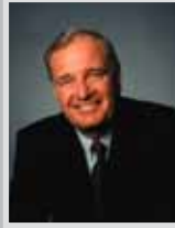
The Right Honourable Paul Martin Canada's 21st Prime Minister